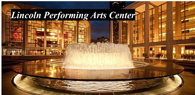
Lincoln Performing Arts Center

The 5-day seminar provides high school music students with a behind-the-scenes look into the many careers available in music. Students will have the opportunity to meet leading music industry professionals and visit the famous institutions that are the leading providers of the professional performing arts in New York City.