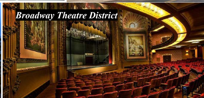
Broadway Theatre District