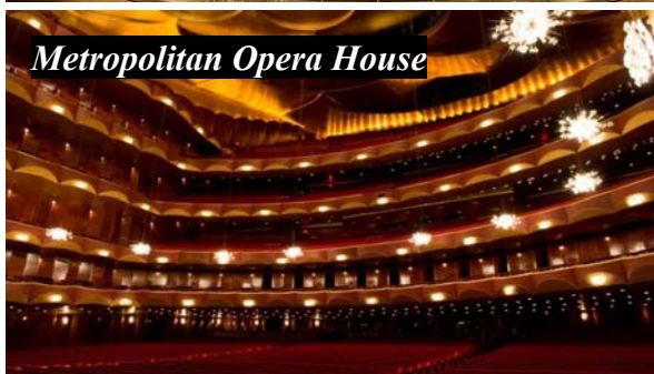
Metropolitan Opera House