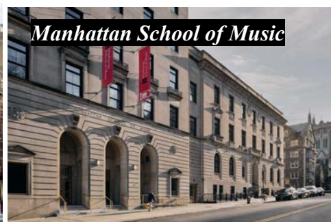
Manhattan School of Music